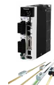
Amp & Scale (Co-development and purchase)