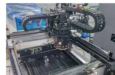
Printed circuit board three-dimensional inspection equipment