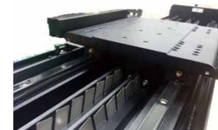
1-axis stage / XY stage