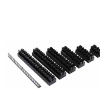
Linear motor (100% in-house production)