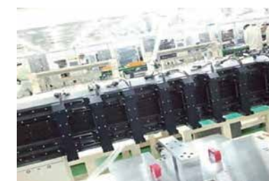
Mobile phone camera assembly equipment