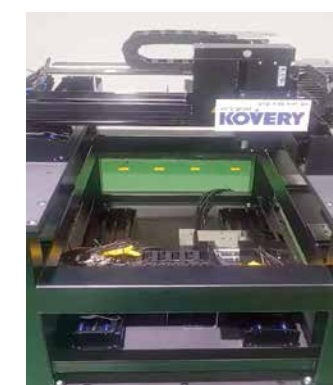
Smartphone / semiconductor inspection equipment